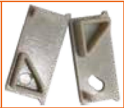
Plastic End Cap

*Please note that unless otherwise indicated, tape lights, extrusions and lenses will come separately and not assembled.